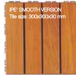
ipe' | SMOOTH VERSION Tile size: 300x300x30 mm

Our outdoor wood flooring is available in three versions: