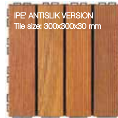
ipe' | ANTISLIK VERSION Tile size: 300x300x30 mm

Specifically designed for surfaces such as around swimming pools, for seaside lidos and health spas, where it is essential to be able to walk barefoot in absolute safety.